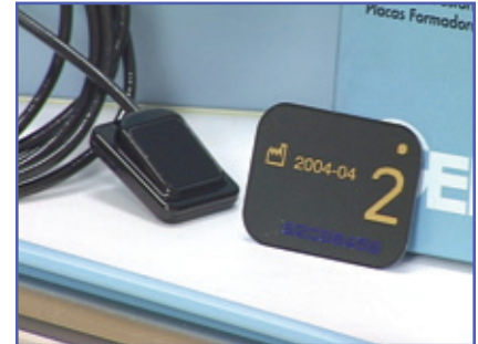
Digital x-ray sensor and plate