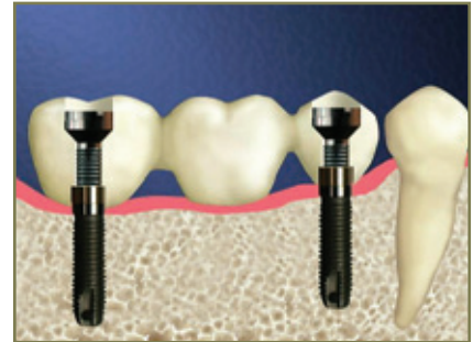
Bridge secured by implants