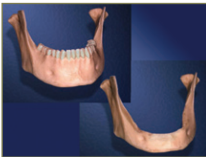
Receding jaw bone

If you have a lower denture, you probably know how hard it can be to eat comfortably. When lower teeth are lost, the bone in the jaw continually recedes. Over time, this causes a lower denture to become loose and floppy. Even worse, there are nerves in the lower jaw that can end up on the surface of the bone. When you bite down, it hurts.