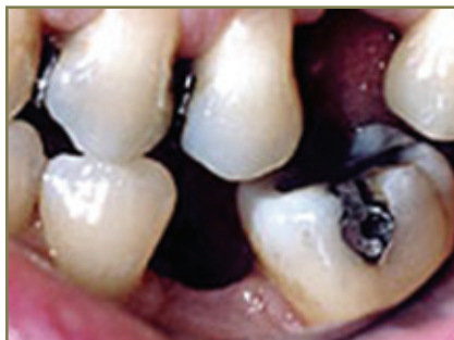
Teeth can shift

For all these reasons, it's critical that we replace a lost tooth. An excellent option for replacing a missing tooth is an artificial tooth secured by a dental implant. Implants are titanium cylinders that are surgically placed in your jaw to serve as artificial tooth roots. Attaching a replacement tooth to an implant allows us to avoid placing a bridge. Bridges require that we prepare the adjacent natural teeth, and that weakens them substantially.