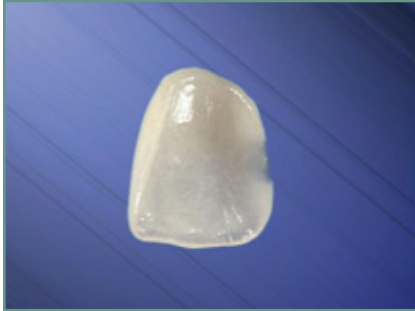
A translucent porcelain shell