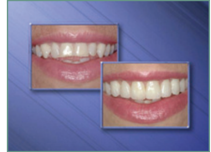
A dramatic improvement

A veneer is a thin shell of porcelain or plastic that is bonded to a tooth to improve its color and shape. A veneer generally covers only the front and top of a tooth. Veneers can be used to close spaces between teeth, lengthen small or misshapen teeth, or whiten stained or dark teeth. When teeth are chipped or beginning to wear, veneers can protect them from damage and restore their original appearance.