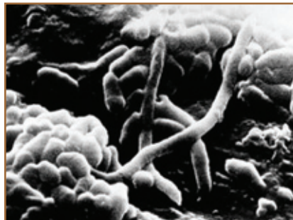
Plaque causes periodontal disease