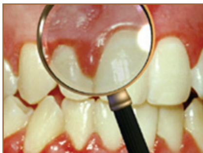
Inflamed and swollen gums

When too much bone is lost, there's so little support for the teeth, they get loose and have to be removed.