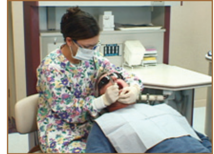
Several appointments are needed