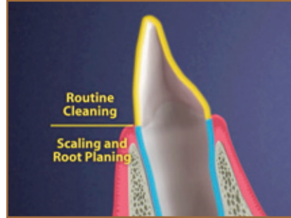
Root planing depth