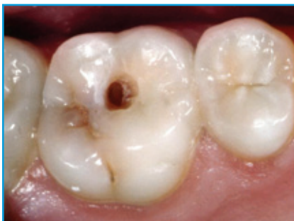
Acid causes cavities

In science classes, you've learned to be very careful with acid. Did you know that you can have acid in your mouth, and that this acid can cause a hole to develop in your tooth?