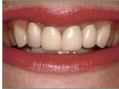
Metal can mean dark lines