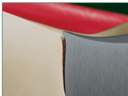
Bacteria between the tooth and filling

Replacing a failing amalgam filling with a new restoration can prevent more decay from developing and keep your mouth healthy.